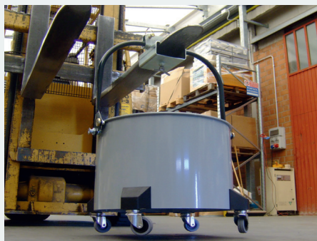
Container transport and discharge system with lift truck