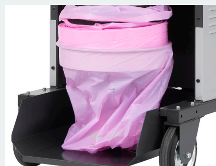
Longopac is available in standard and antistatic version