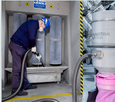
Recovery of very fine dust in coating industry.