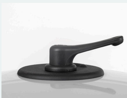
Manual filter shaker