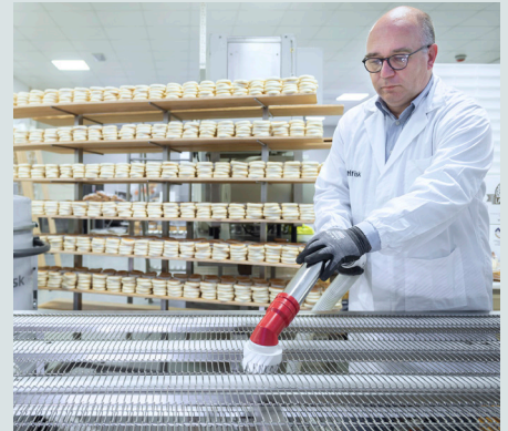
Cleaning of production line in food industry.