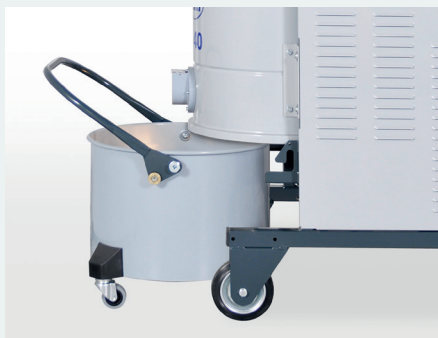
Container release system