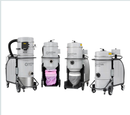
Available models in L-M-H class, in ATEX version, with Longopac or cartridges... and many more.