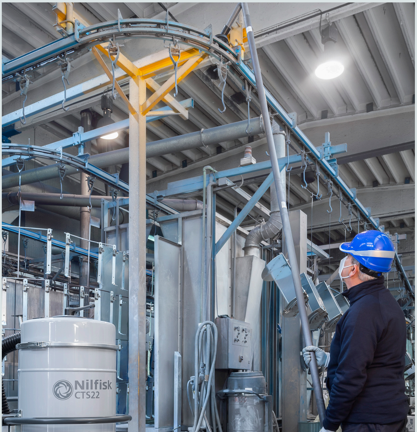
Easy and practical overhead cleaning